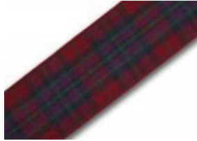
Pride of Scotland Autumn