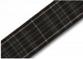
Pride of Scotland Hunting