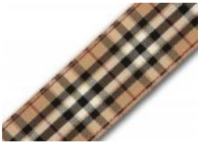
Pride of Scotland Gold