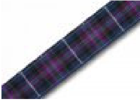
Pride of Scotland Modern