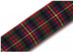
Cameron of Erracht