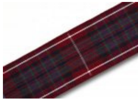
Pride of Scotland National