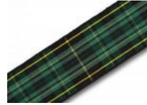
Pride of Ireland