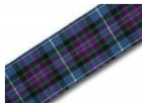
Pride of Scotland Ancient