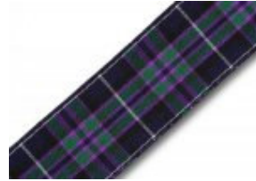
Pride of Scotland Highland