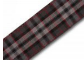
Pride of Scotland Silver